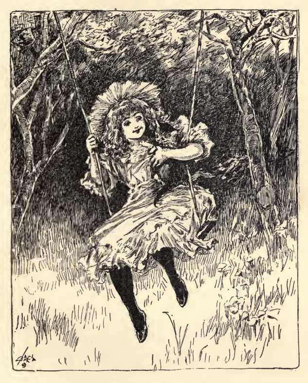
"I DID NOT LIKE THE SWING AT FIRST"